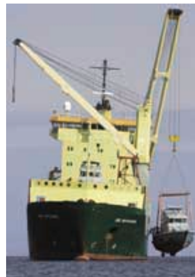
Above – CEC Mayflower offloading

HM ships Pursuer and Dasher , weighing 49 tonnes each, were taken from Portsmouth to Akrotiri where they will be used to provide a round-the-clock deterrent to drug smuggling and illegal immigrant trafficking.