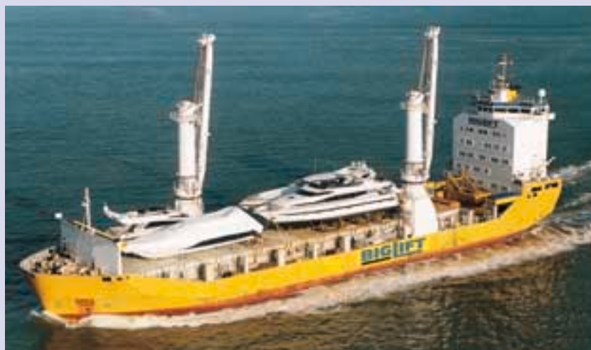
Above – m/v Transporter

If you are born in the historic seafaring town of Plymouth, love messing about in boats and your hobbies are heavy metal music, traditional rope seamanship skills, writing and sea fishing there is only one career open, and that's a life at sea.