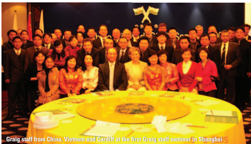
Graig staff from China, Vietnam and Cardiff at the first Graig staff seminar in Shanghai