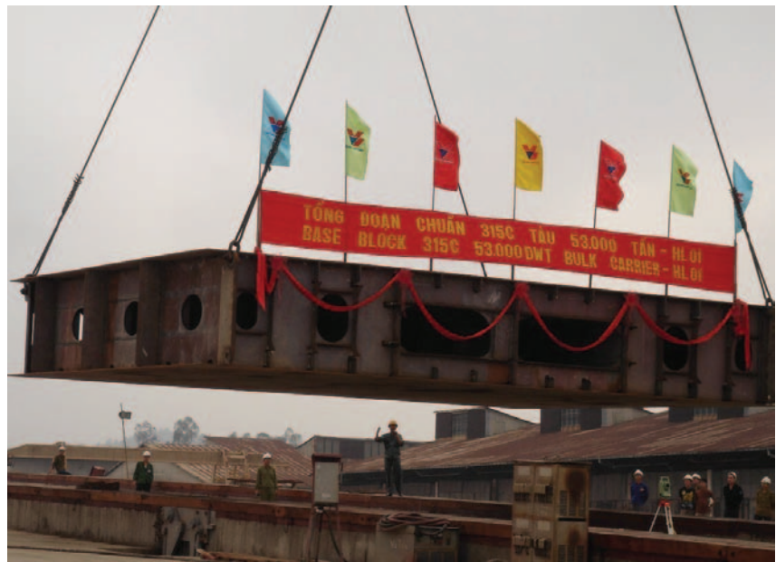
Keel laying for the Diamond 53 vessel to be built at Ha Long Shipyard, Vietnam